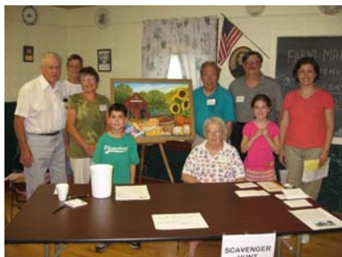
Members of Plumsteadville Grange pose with some of the 180 participants in the Scavenger Hunt.

Teams traveled to 10 sites throughout Plumstead ~ learning about some historical sites and enjoying fun activities at its parks. Plumsteadville Grange was site # 4 on the hunt. Over 180 people traveled to our building learning about the Plumsteadville Grange Founders and the year it started. Participants needed to shake hands with a member at which time many learned about our farmers market. For photos of the event visit www.plumsteadparkandrec.org